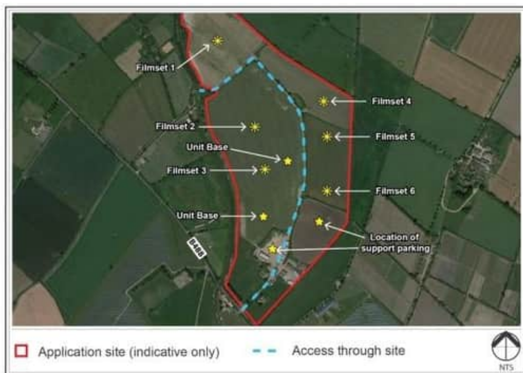
Figure 2: Aerial map

A map of the site submitted to the council as part of Western Sky Ltd's planning application