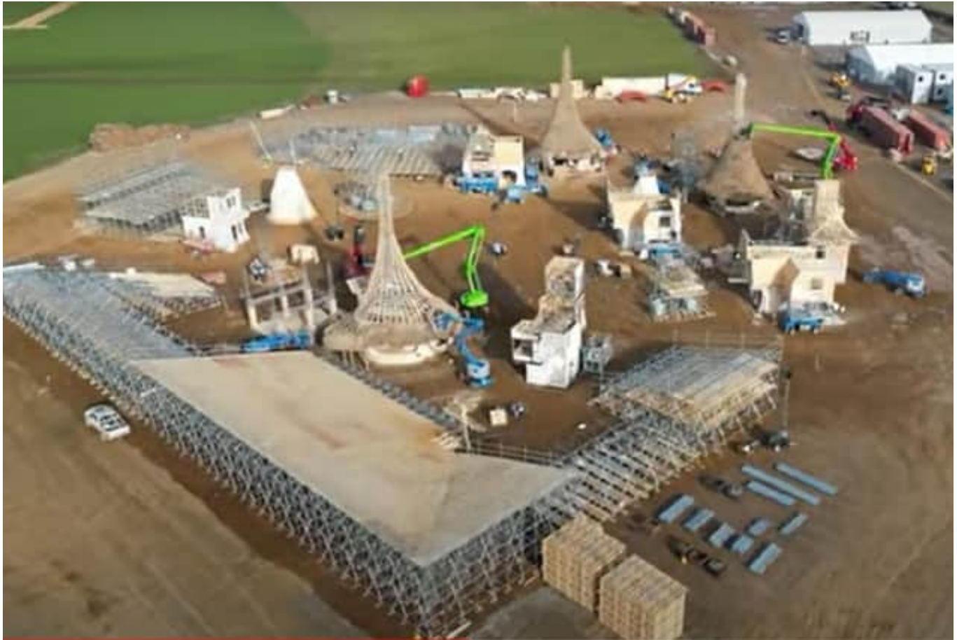
Drone footage of the rumoured film site in Ivinghoe.

Meanwhile, the lighting and rigging crew are reported to have been drinking in village pub, the Rose and Crown, and the YouTube footage also reveals a planning notice submitted to Buckinghamshire Council by Western Sky Limited.